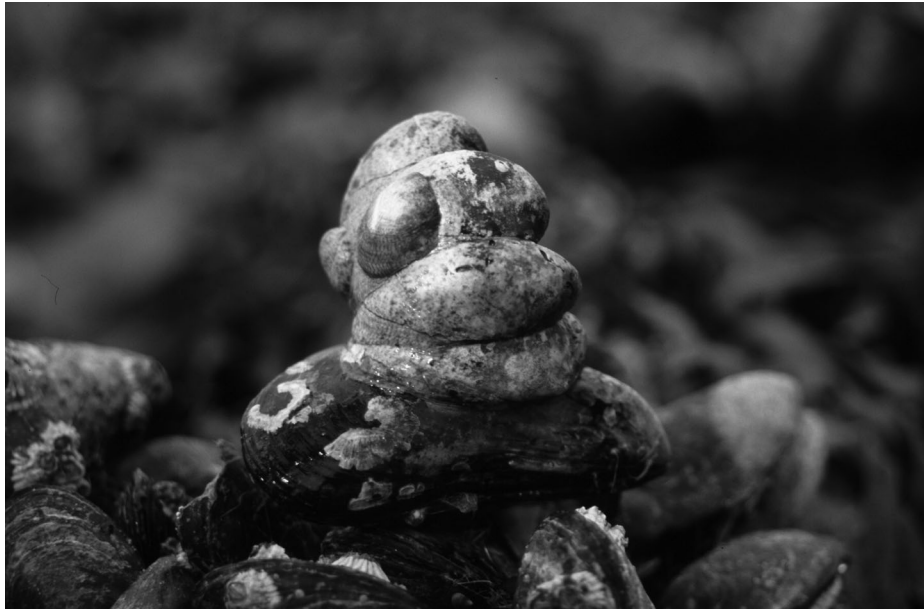
Figure 1. Stack of slipper limpets Crepidula fornicata on a blue mussel Mytilus edulis on a mussel bed.

more than twice as much byssus threads as unfouled mussels ( 5.4 \pm 0.6 byssus threads/mussel/day) with the difference being statistically significant (Tukey HSD-test for unbalanced sample sizes; P < 0.001 ). Mussels from which C. fornicata had