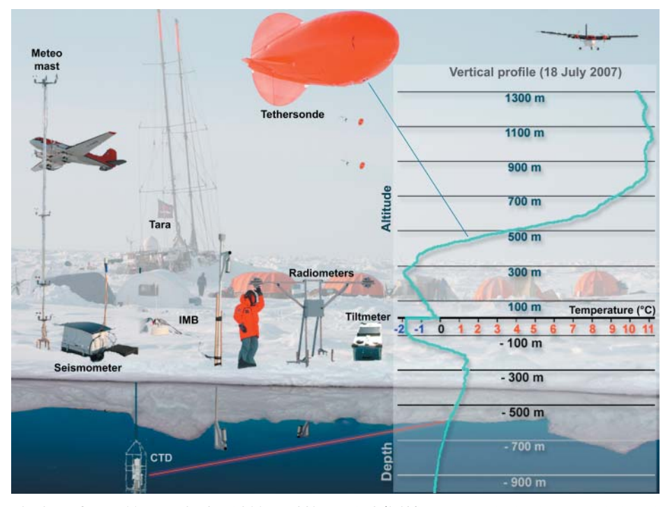
Fig. 2. Ice Station Tara on 21 April 2007 at 88°N and 135°E. The tents in the background sheltered the Damocles scientific team. Instruments are shown in the foreground together with a vertical temperature profile (taken on 18 July 2007) from 1300-meter altitude down to 1000-meter depth.

The Tara Damocles mission will help to significantly improve our understanding of the Arctic Ocean at a time this ocean is experiencing drastic changes, by providing critical long time series of key climatic variables such as temperature in the lower atmosphere, in the upper ocean, and through the ice; salinity in the ocean; humidity in the atmosphere; winds and currents; and various parameters characterizing sea ice (thickness) and solar