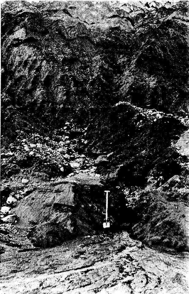
Fig. 1: Two debris covered ice-ridges, connected at the base and extruding out of the glacier slope (the left ending behind the spade) with an excavated push- and pile-moraine (see Fig. 10 in HEIM, 1984).