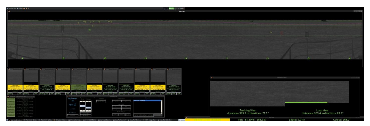
Figure 1 Screen shot of graphical user interface (using 3 wide-aspect displays). Top: 360° real time view of the ship's surroundings. Middle left: 10 verification windows showing 10s-loops of latest events. Middle right: 10s loop and tracking view of latest event location. Bottom left: Control panels.