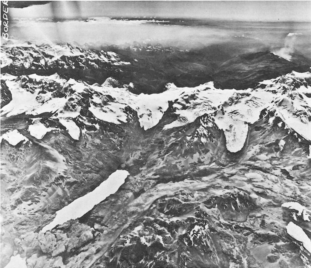
Fig. 3: Northern part of the Cololo Massif in the Cordillera Apolobamba, looking toward the NE. The gentle slopes in the foreground are orientated towards the Altiplano. In the background the steep, deep-shaped tributary valleys of the Amazon; here the Pelechuco Valley. Photo released by the IGM, La Paz, Bolivia. Trimetrogon-flight by USAF, 10 August 1948. Position: UTM N-8358000/E-485000, 14° 50' S, 69° 06' W