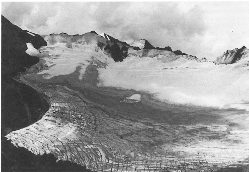
Fig. 2: Ablation patterns of a west-facing glacier at the Huayna Potosi (UTM N-8202000, E-5890000, 68° 10' W, 16° 15' 30" S). 22-12-1980, about 5400 m altitude