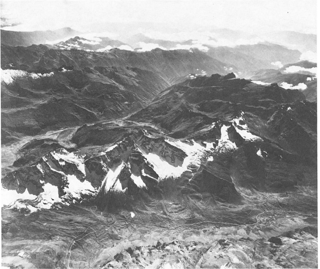
Fig. 4: A mountain range at the Cumbre of the Cordillera Real in the NE of La Paz. Running from east to west the mountain chain between Unduavi Valley and Pajchiri Valley demonstrates the differences of glaciation determined by exposition in the marginal tropics. While the southern slopes are considerably glacierized, slopes facing north and north-east are almost free of snow and ice. Position: UTM N-8195000, E-605000, 68^{\circ} 01' W , 16^{\circ} 21' S