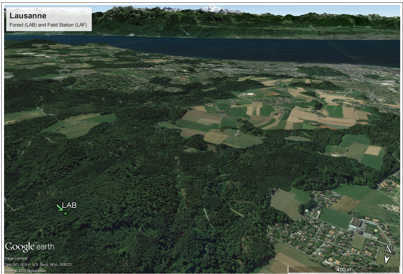
Figure 1: Site aerial photo from both Lausanne stations.

The measurements were carried out at Lausanne in the Swiss Canton of Vaud, situated in the north of the city Lausanne which is part of Swiss Midlands (Fig. 1). Time series of two plots have been recorded, one within the forest (Fig. 2a) and a second one outside of the forest (field station, Fig. 2b). Tab. 1 shows further details on the research station characteristics.