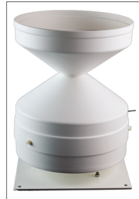
Figure 4: Precipitation sensor