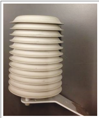
Figure 3: Combined air temperature and humidity sensor