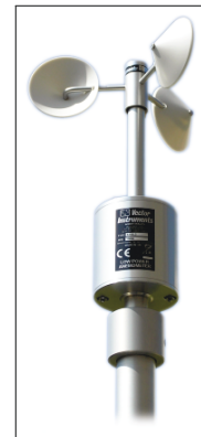
Figure 6: Wind speed sensor