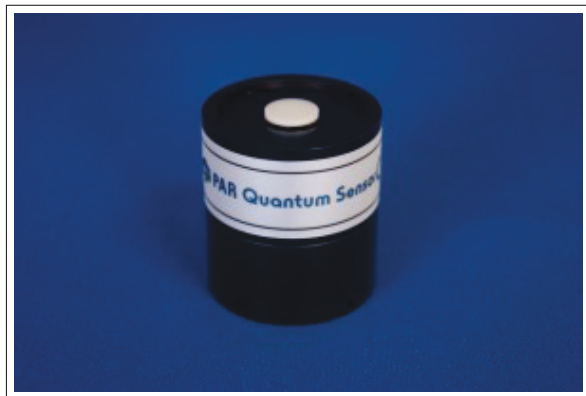
Figure 5: PAR sensor