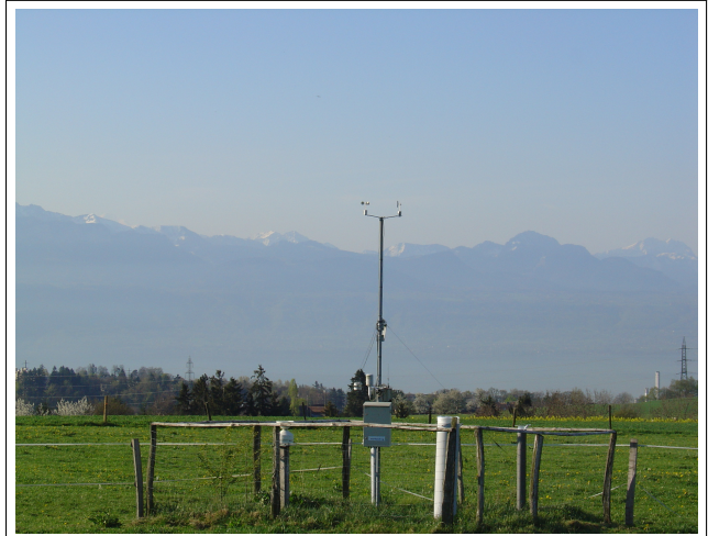
(b) LAF: Field station