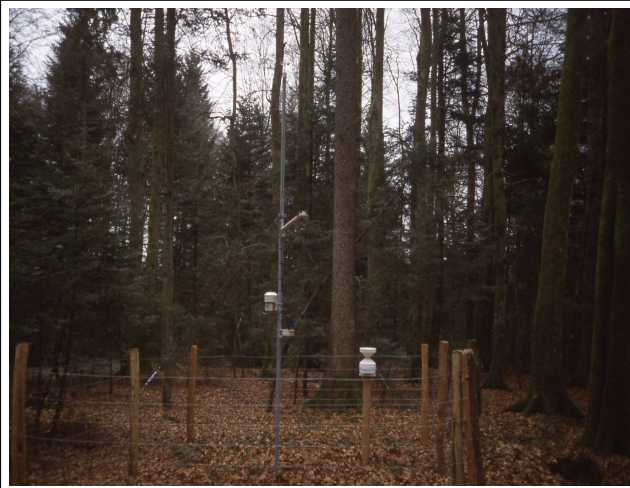
(a) LAB: Forest station