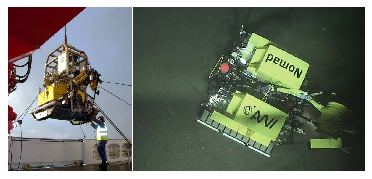
Fig. 2: Launching of the benthic crawler NOMAD (left) and arrival of the system at the seafloor(right).

Fig. 1: Recovery of the "arcFOCE" (arctic Free Ocean Carbon Enrichment) system after its first test deployment west off Svalbard.