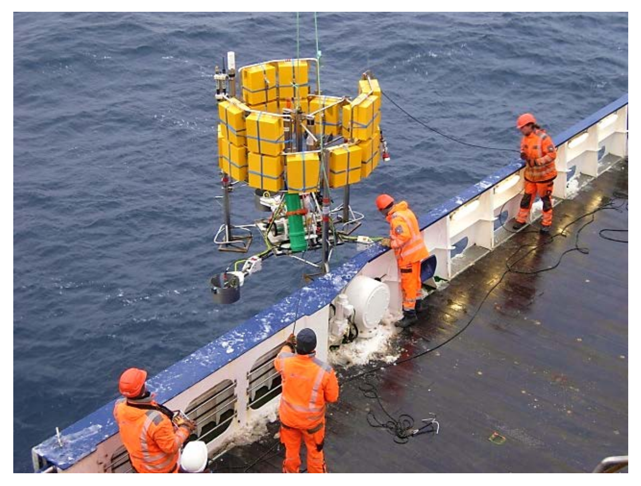
Fig. 1: Recovery of the "arcFOCE" (arctic Free Ocean Carbon Enrichment) system after its first test deployment west off Svalbard.