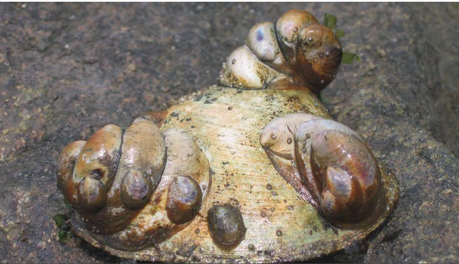
Figure 4.1: American slipper limpet ( Crepidula fornicata ).