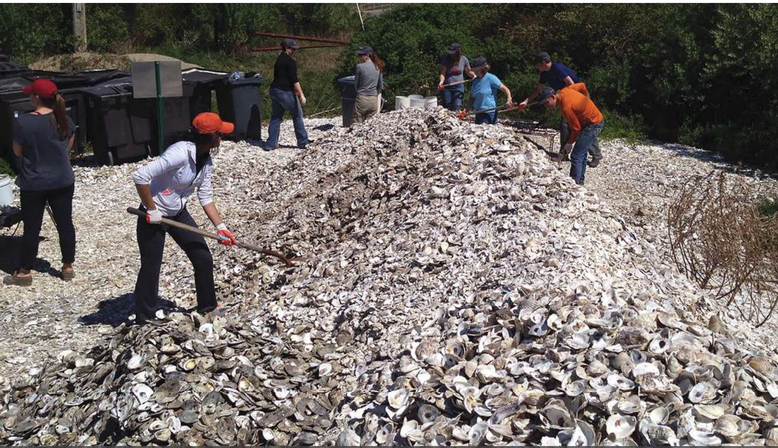
Figure 4.3: Community members preparing a pile of cured recycled shells for deployment in Rhode Island, USA.

Involving overarching restoration networks with prior experience of dealing with regulatory agencies and the concerns these agencies may have, can help to facilitate the regulatory acceptance of restoration.