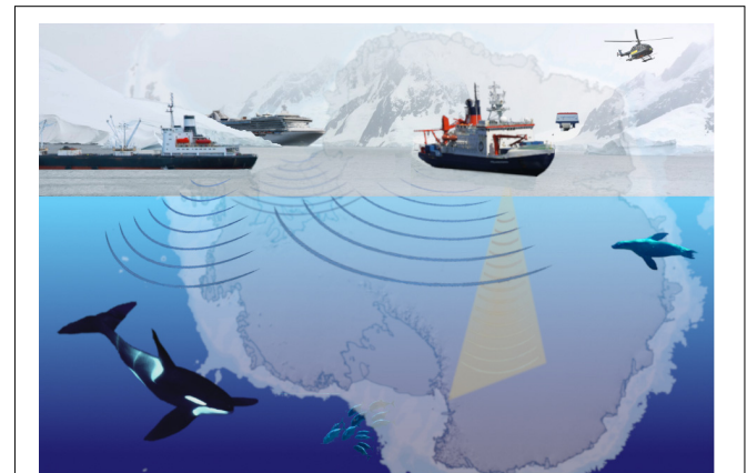
FIGURE 1 | Sketch of sources of underwater noise in the Antarctic. All vessels (fishing vessels, cruise ships, research vessels, etc.) produce underwater noise in a nearly omni-directional pattern (indicated by circular sound wavefronts). Ships use echosounders that scan the sea floor with a narrow swatch of sound (indicated in yellow). Research station infrastructure and support includes construction activities, vessels as well as aircraft—all of which may be detected under water.