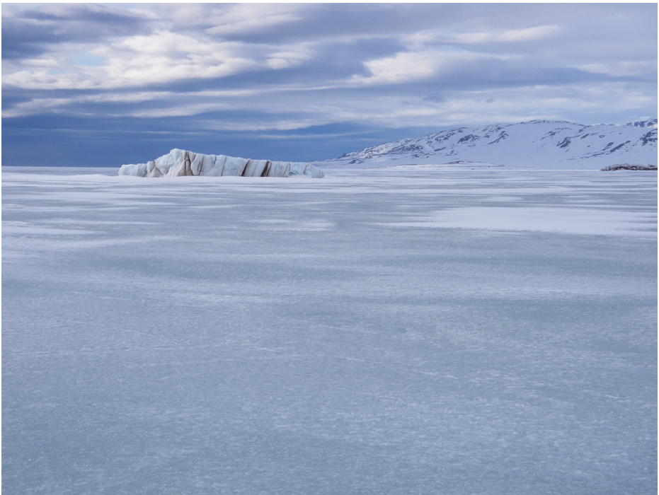
Figure 1: Landfast sea ice in Kongsfjorden in spring 2009, with an iceberg in some distance.

Landfast sea ice covers the inner parts of Kongsfjorden, Svalbard, for a limited time in winter and spring months, being an important feature for the physical and biological fjord systems (Figure 1). Systematic fast-ice monitoring for Kongsfjorden, as a part of a long-term project at the Norwegian Polar Institute (NPI) was started in 2003, with some more sporadic observations from 1997 to 2002. It includes the ice extent mapping and in situ measurements of ice and snow thickness, and freeboard at several sites in the fjord. The permanent presence of NPI personnel in Ny-Ålesund Research Station enables regular in situ fast-ice thickness measurements as long as the fast ice is accessible. Further, daily visits to the observatory on the mountain Zeppelinfjellet close to Ny-Ålesund, allow regular ice extent observations (weather, visibility, and daylight permitting). Data collected within this standardized monitoring programme have contributed to a number of studies. Monitoring of the sea-ice conditions in Kongsfjorden can be used to demonstrate and investigate phenomena related to climate change in the Arctic.