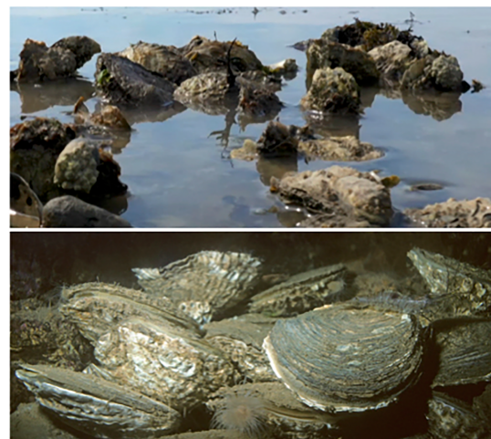
FIGURE 1 The native European oyster, Ostrea edulis . As an ecosystem engineer and an ecological keystone species, it provides a range of ecosystem functions and services

Active knowledge transfer has been established within the growing NORA community, which connects institutions, experts, and practitioners from research, nature conservation, and commercial production, as well as ecological consultants, policy advisors, and local stakeholders (see www.noraeurope.eu ). There are annual meetings to present results, to discuss and exchange experiences between active restoration projects and oyster producers, and to increase cooperation between them. The community is represented via the advisory board and will collaborate on defined topics in specific working groups. In addition, the NORA Secretariat maintains communications, organizes conferences, and coordinates the activities of the working groups.