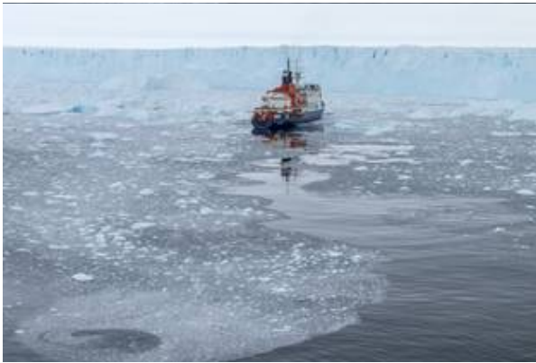
Polarstern at Pine Island Glacier

The new maps of the ocean floor in Pine Island Bay, which is predominantly 800 to 1,000 metres deep, reveal a previously unmapped submarine ridge and two mountains, the peaks of which reach up to a water depth of 370 metres. The Pine Island Glacier’s