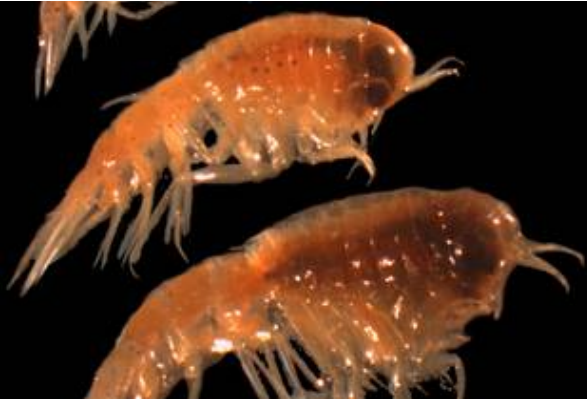
Amphipod Themisto compressa

He and his team are just as curious to see what data the moorings' biological and chemical sensors have gathered. These sensors, which are still in the pilot phase, will hopefully offer a wholly new perspective on how the interplay of water masses affects productivity