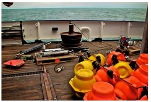
Polarstern Expedition

Every second, the West Spitsbergen Current transports roughly six million cubic metres of water northwards, through the eastern Fram Strait. Over the past 30 years the average temperature of these water masses has risen by one degree Celsius – today, measuring between three and six degrees Celsius, the Atlantic water is comparatively warm for this area at the transition to the Arctic Ocean. Just 200 kilometres to the west, water measuring a frigid minus 1.8 degrees Celsius flows out of the Arctic Ocean, together with sea ice, headed south. In theory, these water masses should never come into contact with one another. But in reality, thanks to small-scale eddies they do mix, and only part of the warm water continues northward to the high Arctic. As a result, warm water can instead find its way to the glaciers calving into the sea on the eastern coast of Greenland, melting them from below.