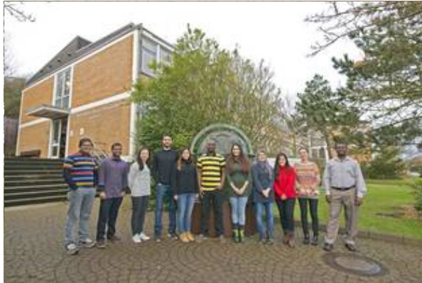
POGO-Stipendiaten 2017/18

For the past decade, every year ten young men and women have been invited as guest researchers by the POGO Centre of Excellence, since 2013 the scholars stay at the AWI's facilities on Helgoland, Sylt and in Bremerhaven, while their final projects may take