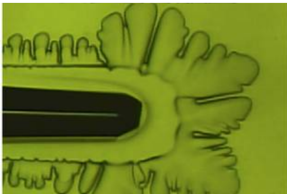
Ice crystal under the microscope

Organisms living in cold zones produce ice-binding (antifreeze) proteins to prevent themselves from freezing to death. Such proteins have been classified in two groups; the hyperactive type attaches to the hexagonal basal faces of ice crystals to inhibit ice crystal growth and lowers the freezing temperature by up to six degrees C while the moderate type does not attach to the basal faces and lowers the freezing temperature by not more than 1 degree C.