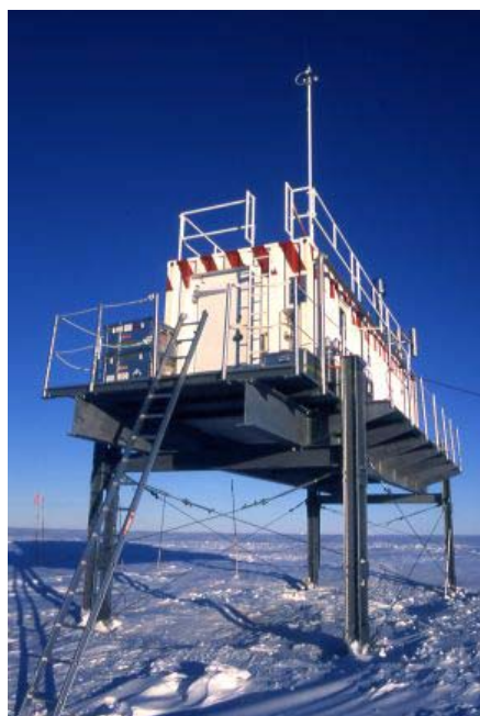
Figure 3: The GAW Global Air Chemistry Observatory Neumayer.

The first air chemistry observatory at Neumayer was initiated and constructed by the Institut für Umweltphysik, University of Heidelberg (UHEI-IUP) in 1982. Following almost 13 years of operation, the technical equipment and the data acquisition facilities had to be renewed. The present observatory was designed in collaboration between AWI and UHEI-IUP as a container building placed on a platform some metres above the snow surface, see Figure 3.