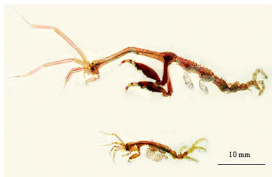
Figure 1. Male (top) and female (bottom) Caprella mutica

Carlton (1979) suggested that C. mutica arrived on the Pacific and Atlantic coasts of North America either as a result of numerous independent cross-oceanic introductions with oyster spat, or from small scale transport following its first introduction (Carlton 1996). Direct sequencing of mitochondrial DNA indicates that C. mutica was introduced to Europe either directly from Asia or from the Atlantic coast of North America (Ashton 2006). Opportunities for the spread of non-native species to Europe across the Atlantic have existed for more than 500 years with early exploration and the subsequent establishment of shipping routes (Stoner et al. 2002). For a little more than a century ships' ballast water has