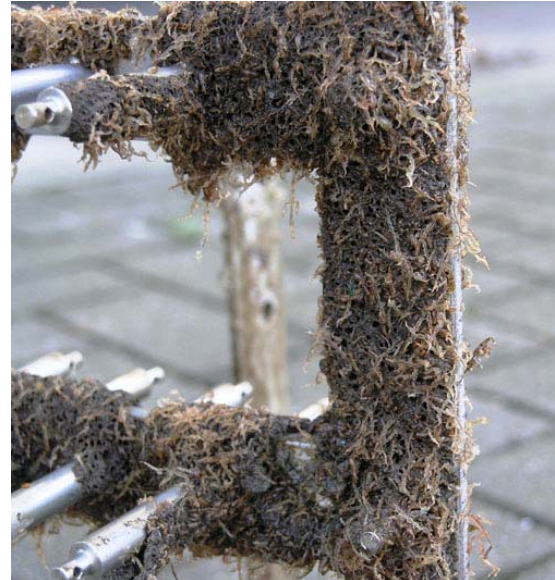
Figure 3. Experimental frame deployed west of Zeebrugge, Belgium in 2007 showing dense aggregations of Caprella mutica after 12 weeks immersion

Mediterranean Sea on account of the high summer seawater temperatures (Cook et al. 2006).