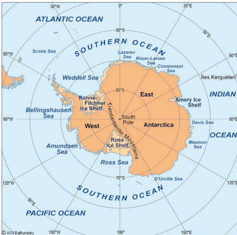
Inventory of ship tracks with multi-beam data from the GEBCO, IHO DCDB and AWI.

paleobathymetric maps with special emphasis on submarine gateways and barriers for an updated plate tectonic reconstruction of the Southern Ocean. Another application is the correlation between variations in gravity anomalous roughness and their relationship to topographic lineaments in the abyssal plains. This relationship could be diagnostic for the tectonic heterogeneity of the oceanic crust, because transform faults cannot be identified primarily by echosounding data due to marine sediment coverage. Therefore, the knowledge of fault patterns assists the estimation of crustal behaviour, for example, localisation of potential earthquake hypocentres for use in tsunami early-warning systems. GIS-based analyses of bathymetric data do not only provide water-depth information, but also derived digital terrain model parameters, for example, slope, aspect, curvature and terrain variability. Multi-scale terrain analyses of multi-beam data are important descriptors for benthic habitat mapping. The partially ice-covered continental slopes of Antarctica are sensitive ecosystems and habitat mapping may deliver characterisation of bathymetric features in their regional context to marine researchers, for example, the Bathymetric Position Index (BPI). Bathymetric data