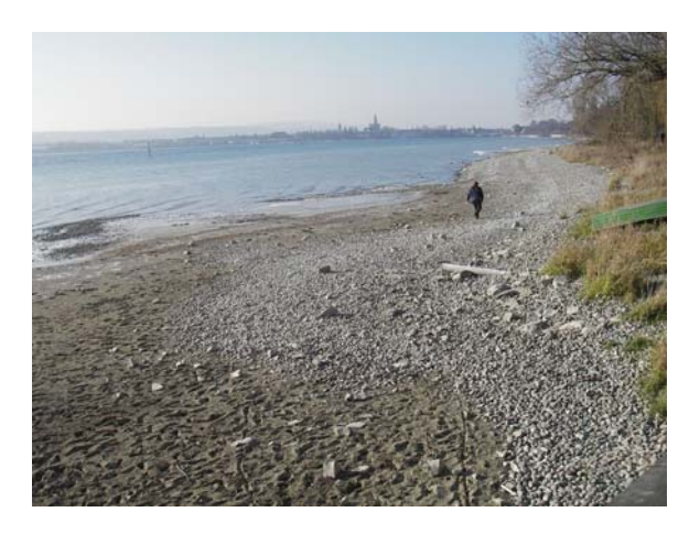
Fig. 2 The dry-fallen littoral near Konstanz, December 2005.

The following articles are an attempt to compile current knowledge on ecological effects of WLF in lakes. They span a wide range of geographic regions, morphological lake types and applied scientific disciplines. The publications presented here are the results of a workshop hosted by the collaborative research centre on lake littoral ecology at the University of Konstanz (SFB 454-Bodenseelitoral) in December 2005. Participants at this conference witnessed Lake Constance during an extreme drought of the lake which occurred that winter, exposing large parts of the littoral zone (Fig. 2) and causing dramatic reduction of the Dreissena mussel population in frostexposed zones, which are an important food source for water fowl (Werner et al., 2005). The recently reported invasive clam Corbicula fluminea also