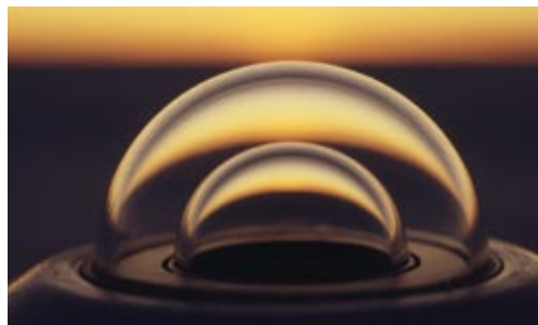
Fig 2: Glass domes of a pyranometer during the polar night at Neumayer. The pyranometer serves to measure solar and diffuse sky radiation.

The World Radiation Monitoring Center not only stores the radiation measurements of many stations which have been sampled every minute, but also many complementary meteorological observations that are necessary to interpret