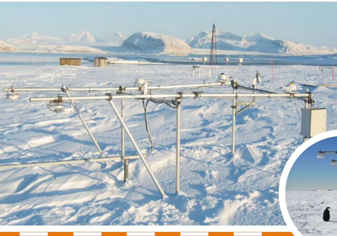
The BSRN radiation measurement fields at two of AWI's polar research stations: Neumayer in Antarctica and Ny-Ålesund in the Arctic.