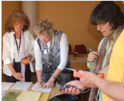
Fig. 4.1-5. (right) Teachers participating in paleoenvironmental change experiment at PolarTEACHERS workshop in Oslo, Norway.