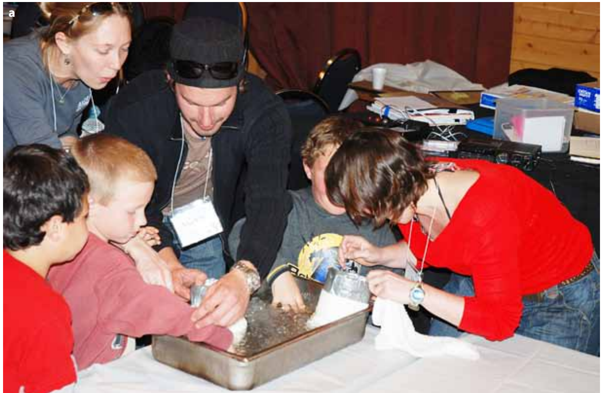
Fig. 4.3-4. During IPY early career researchers were engaged in numerous activities including (a,b) outreach in school classrooms, (c) field courses, and (d) conferences.