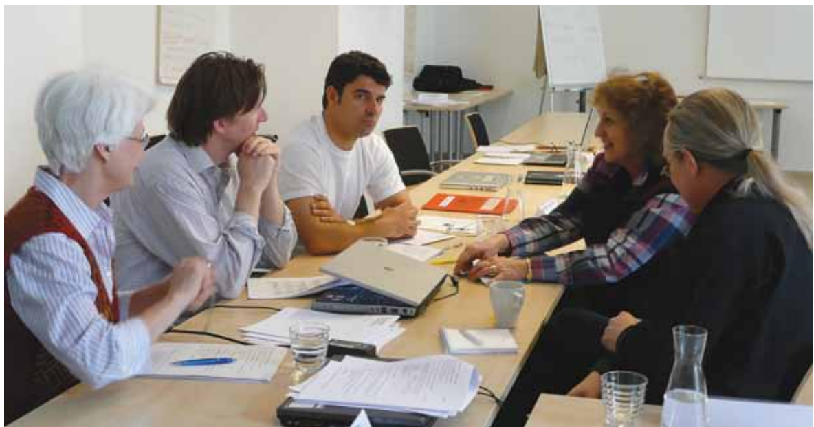
Fig. 4.1-1. Participants at the Strasbourg meeting.

This group included professionals from primary through tertiary education who would be responsible for the selection and promotion of educational