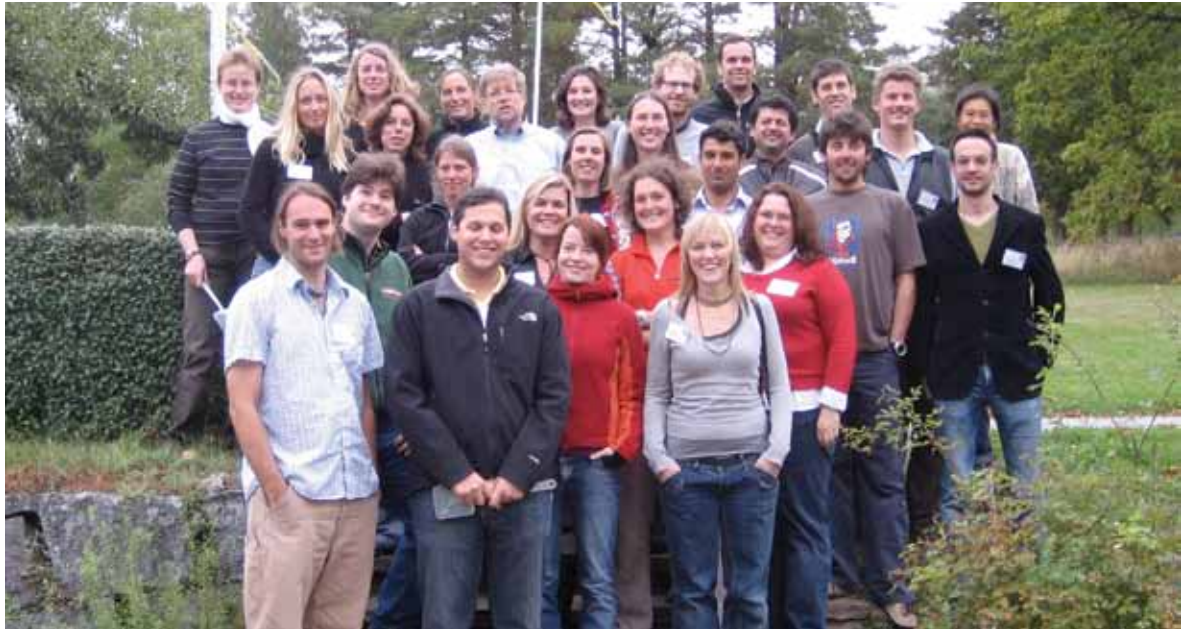
Fig. 4.3-1. Participants of the meeting in Stockholm, Sweden, a key moment in the development of APECS.

Committee. The Council controls issues related to APECS governance and structure, and are expected to act on time scales of months to years. The Council mandates the Executive Committee and Director with shorter time-scale decision making and running APECS on a day-to-day basis.