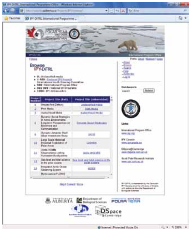
Fig. 4.2-4. Browse screen from IPY-DiTRL.

for DiTRL to develop a more user-friendly querying system were seen to be of benefit, but in late 2008, with the closure of the IPO likely to happen in March 2009 (later postponed until September 2010), having a working system was a great advantage. At this stage, the priority was collecting the information, rather than accessing it. It was envisaged that once the information had been collected it would become easier to obtain funding to develop access.