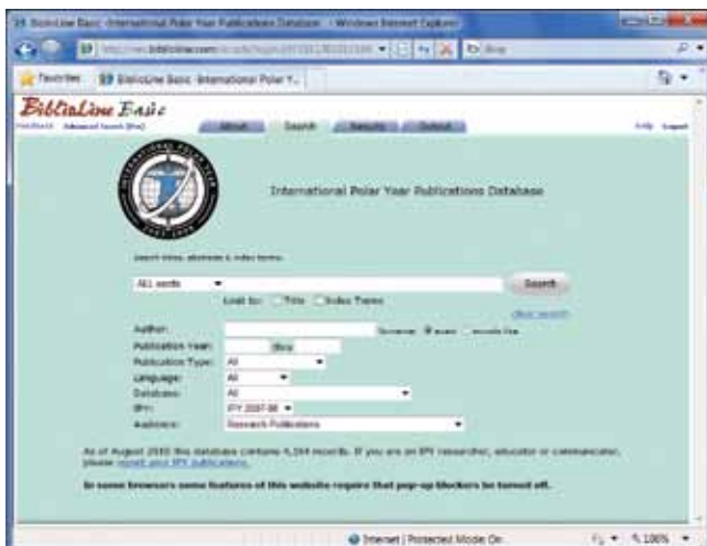
Fig. 4.2-1. IPYPD Basic search page