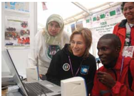
Fig. 4.1-3. Connecting to a live event at the TUNZA UNEP conference in Stavanger, Norway during the June 2008 'Land and Life' Polar Day.

Polar Oceans Day was so popular that events such as live webcasts, public talks, radio programs, school visits and videoconferences were scheduled over an entire week. The different events involved participants in at least nine different countries including, Brazil, Canada, France, Germany, Malaysia, Mexico, Scotland (U.K.) and U.S.A.