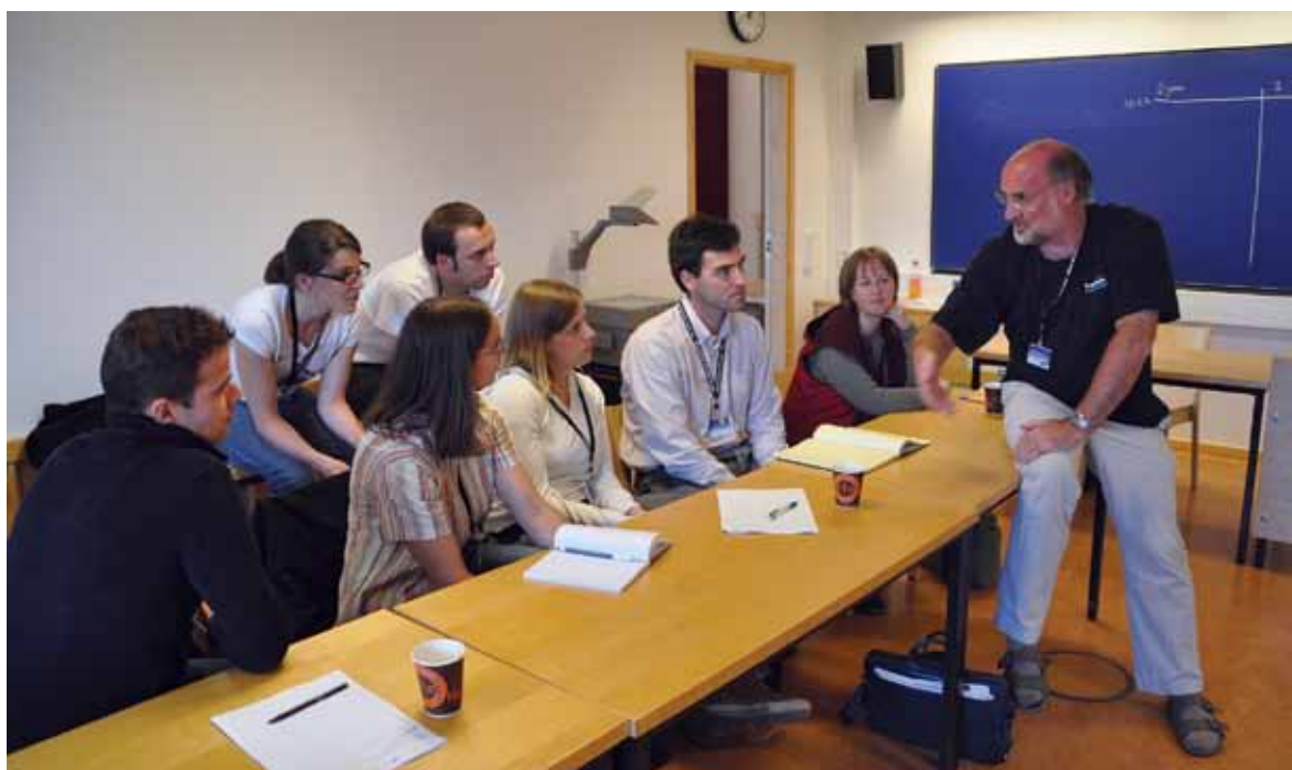
Fig. 4.3-3. Early career scientists attending an APECS mentoring session.

A key focus of APECS's activities has been to help early-career scientists network and obtain advice from more experienced researchers and polar professionals.