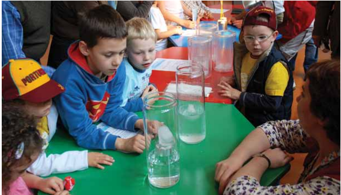
Fig. 4.1-2. Students in Portugal took part in ice experiments at the Lisbon Pavilion of Knowledge for the launch of IPY.

working group prepared and distributed press releases. The tradition of a virtual 'balloon launch' on Tagzania was also continued for each of the Polar Days.