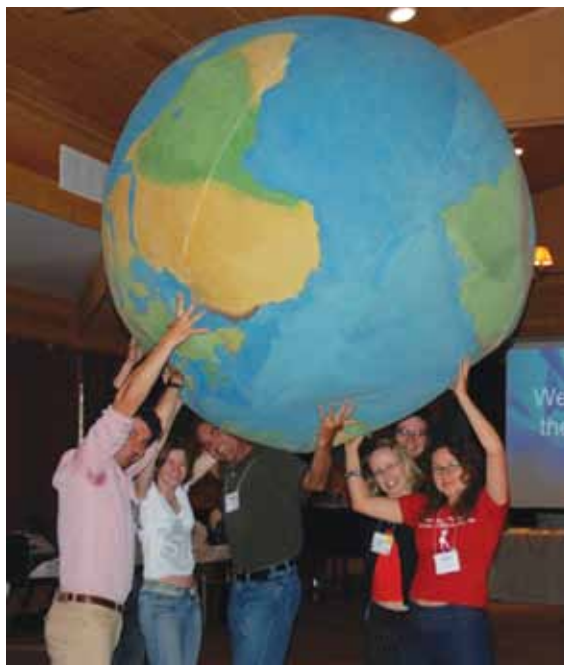
Fig. 4.3-2. Presenting their work at conferences is essential for the development of early career scientists.

APECS has created an online polar literature discussion platform ( http://apecs.is/literature ) where researchers share results, carry on discussions, get