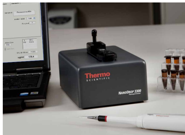
Thermo Scientific NanoDrop 3300 Fluorospectrometer