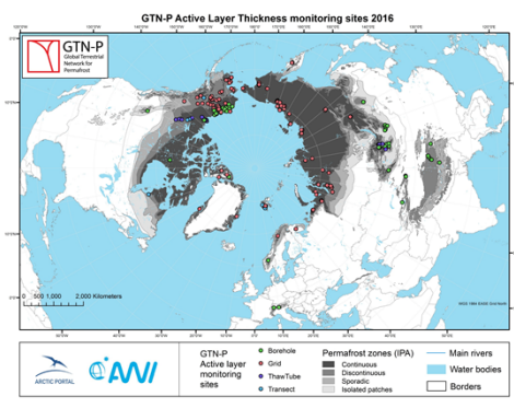
Map of active layer monitoring sites in the Norther Hemisphere. Note that majority of the sites are grids (100 x 100 m or 1 x 1 km) allowing estimations of spatial variability of ALT.

Using DMS capabilities we selected sites with data available around the last International Polar Year (2005-2009), when major push was made to improve the permafrost observational network, and in the last five years (2010-2015). The selected sites were used to estimate changes in thermal state of permafrost and active layer thickness between the two reference periods. The preliminary results are outlines below.