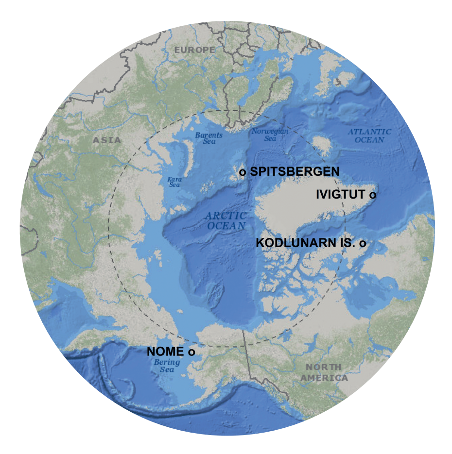
Fig. 1: The Arctic Ocean basemap indicates the locations of the four case studies of Kodlunarn Island, Ivigtut, Nome, and Spitsbergen, which were chosen on the grounds of geographical and temporal spread.

Abb. 1: Die Basiskarte des Arktischen Ozeans zeigt die Lage der vier Fallstudien Kodlunarn Island, Ivigtut, Nome und Spitzbergen, die aufgrund der geografischen und zeitlichen Verbreitung ausgewählt wurden.