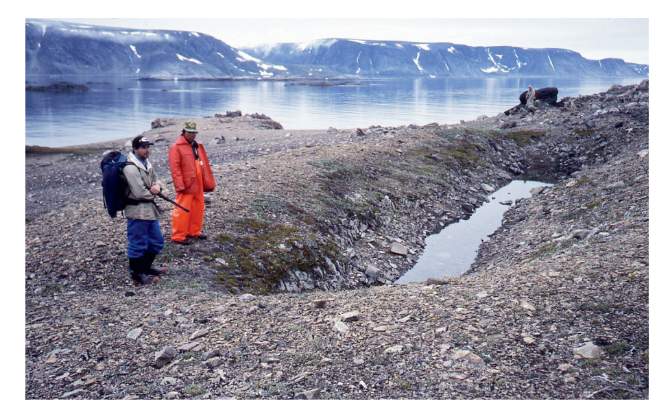
Fig. 2: The inconspicuous Reservoir Trench on Kodlunarn Island in Frobisher Bay has attained Canadian cultural heritage status as part of the earliest European mine in North America and the Arctic.

Abb. 2: Der unscheinbare "Reservoir Trench" auf Kodlunarn Island in der Frobisherbucht erreichte als Teil der ersten europäischen Mine in Nordamerika und der Arktis den Status eines kanadischen Kulturerbes.