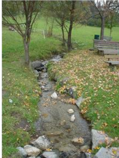
Fig. 2. Piburger See brook V-notch gauge with pressure sensor, data logger & data transfer system close to lake shore at 900 m asl (left), brook at 950 m asl (right)