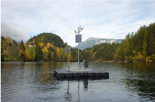
Fig. 2. Monitoring platform at Piburger See