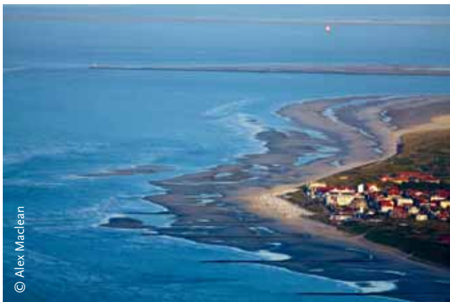
FIGURE 4: Groynes on the beach combat losses of sand at the barrier island of Wangerooge, Lower Saxony, to save a resort built too close to shore. Lost sand is also shuttled back by truck from the downstream end of the island. A better solution would be sufficient replenishment of sand taken from an offshore seafloor.