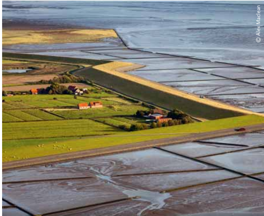
FIGURE 2: Farm houses in Westermarsch, northern Germany, crouch behind a tall dike facing seawards with groynes on the mudflats to enhance sediment aggradation. For more aerial photographs on coastal change see Reise (2015) and www.alexmaclean.com .

Intertidal mud and sand flats – where one can wade across – are termed Wadden or Watten at the southern North Sea coast. The Wadden Sea extends from Den Helder peninsula in the Netherlands through the German Bight to Skallingen peninsula in Denmark, comprising salt marshes, tidal flats (wadden), deep gullies, sand bars, and islands. Linked to the Wadden Sea are the tidal reaches of entering rivers, the estuaries , where fresh and marine waters mix. Land protected by earthen walls ( dikes ) against flooding are called polders (regionally Groden or Koog ). The entire region of the southern North Sea coast comprising the polder land (embanked land) and the Wadden Sea including the estuaries is here named the Wadden Coast .