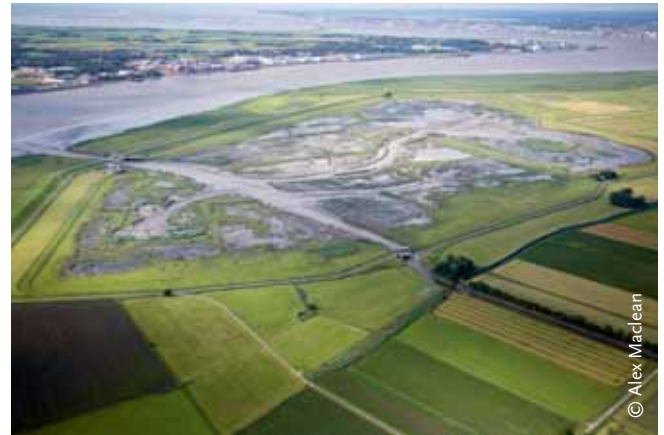
FIGURE 3: Tide polder, Luneplate, at the River Weser, Lower Saxony. Tides swing in and out through a wide sluice in the outer dike (left). The polder also serves as a water reservoir after heavy rainfall via a sluice at the inner dike.

Important are no-regret and economically viable steps of coastal transformation. A timely stop to dredging estuaries ever deeper, testing polders for living with more water, and subtle sand nourishments around islands are recommended for learning by experience. Small island and polder communities, with their sense for local integrity and intergenerational solidarity, may be predestined for transdisciplinary systemic transformation projects. For them, SLR may even offer a chance for more sustainable, improved eco-