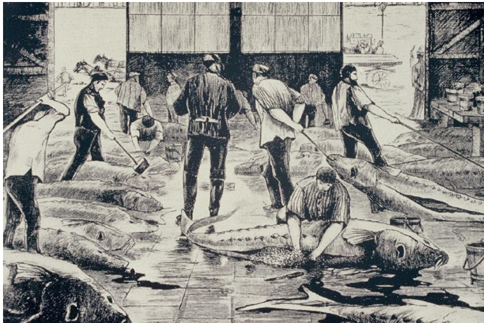
Figure 1: Sturgeon market in Hamburg-St. Pauli mid- 1880ies, Source: LLUL Schleswig Holstein

Wild fisheries are often used with a “free for all mentality”. The sea floor is “out of sight” and thus “out of mind”. The land based analog to this type of resource use is perhaps the opportunistic and indiscriminate harvesting of natural rain forests. At some point, when the main resource is decimated to a point where it is no longer commercially useful, one turns to the culture of organisms (monoculture). In the ocean aquaculture is the natural next step.