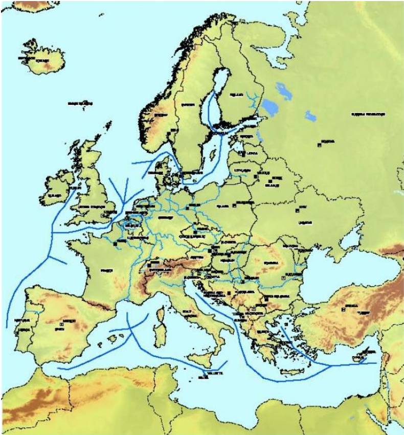
Figure 3: Motorways of the sea EU 2016

transport policy forming the basis for the development of trans-European networks, which also includes short-sea shipping. The short-sea shipping indicator of the EU deals with the shipping pressure of the transport of goods between European destinations. In 1991 and 2001 this indicator grew by a third to approximately 1270 billion tonne-km. This makes it comparable with road transport volumes in Europe, which are already totally overstretched in Europe and desperately in need of respite. The concept “Motorways of the Sea” is aimed at alleviating the pressure on land and at improving market access throughout Europe via the movement of goods across maritime transport corridors. Four corridors for shipping are proposed: One linking the Baltic States to the North Sea, one for Western Europe, one for south Eastern Europe and one for south Western Europe. See Fig. 3 ((32) EU 2016). On the long run it is hoped this should alleviate road pressure on land, rather than just add another transport dimension.