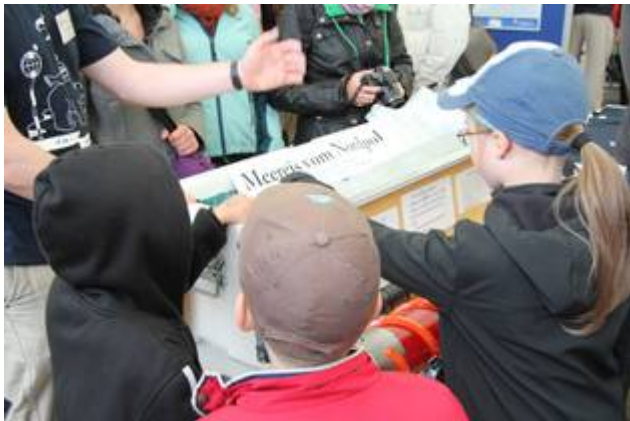
Open Ship in 2012

In the 300 m 2 Science Tent, further research groups will offer glimpses into their work, and be happy to answer visitors' questions. Teams representing the full spectrum of research pursued at the AWI - from physical oceanography, the geosciences and marine biology, to meteorology - will display their research equipment and report on recent discoveries. For the first time, the Science Tent will also feature "science dating": like in speed dating, visitors and researchers will meet for brief question-and-answer sessions, and switch partners every three minutes. "Fireside chats" are another new format, intended to supplement the presentation agenda. The agenda, presentation topics and the list of researchers participating in the science dating will soon be available online at www.awi.de/open-ship .