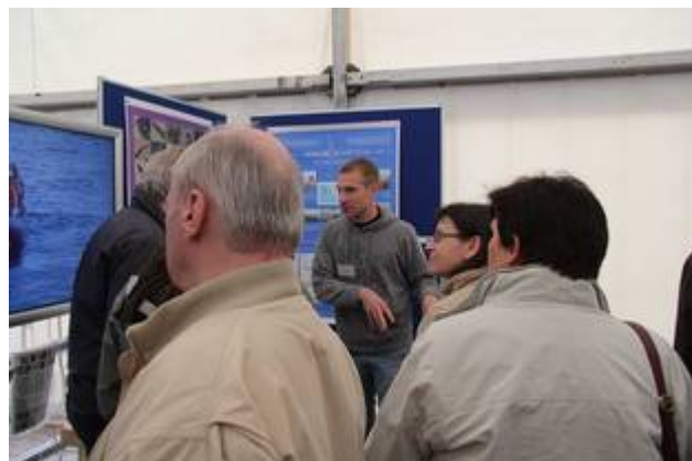
Open Ship in 2012

Visitors will also discover an exciting programme outside the ship, like a diving tower on the shipyards that brings together man and machine. The AWI's Sea Ice group has provided its new diving robot for