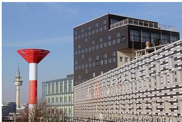
AWI main building

According to Karin Lochte, intensifying its Arctic research is a representative example of how the AWI has expanded the scope of its activities over the past several years. Thanks to the rapid and dramatic changes at work in the region, the North Pole has