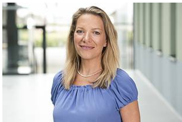
Prof Dr Antje Boetius

As a Leibniz Award winner, Boetius gained extensive science management experience in commissions and on the Senate of the German Research Foundation (DFG), as well as the Wissenschaftsrat (Council of